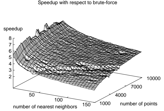
Figure 2: Comparison of the growing-cube method for k nearest neighbor search with the brute-force method